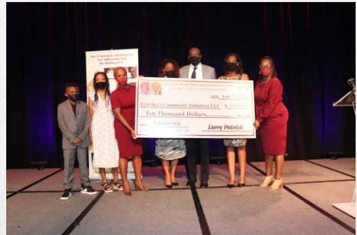
Table + Sponsorship